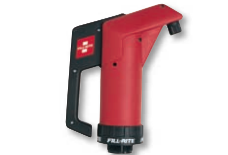
Model FR20 Piston Drum Pump Series 20