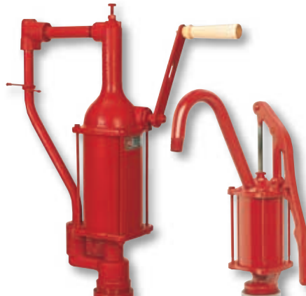
Model FR31 & FR43 Quart or Pint Stroke Pump Series 30