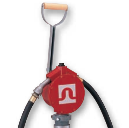
Model FR152 Piston Hand Pump Series 5200