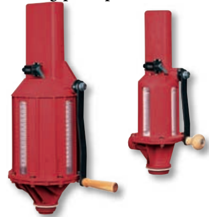
Model FR37 & FR38 Gallon or Quart Volumetric Hand Pump Series 30