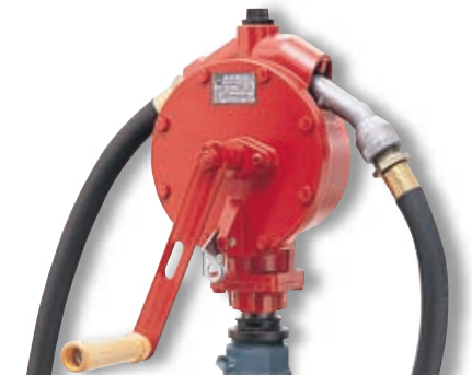
Model FR112 Rotary Hand Pump Series 100