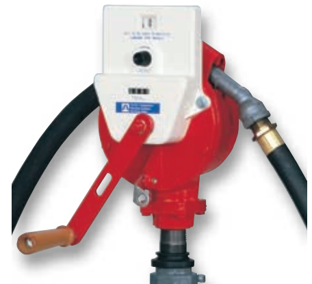
Model FR112C Rotary Hand Pump with Counter Series 100